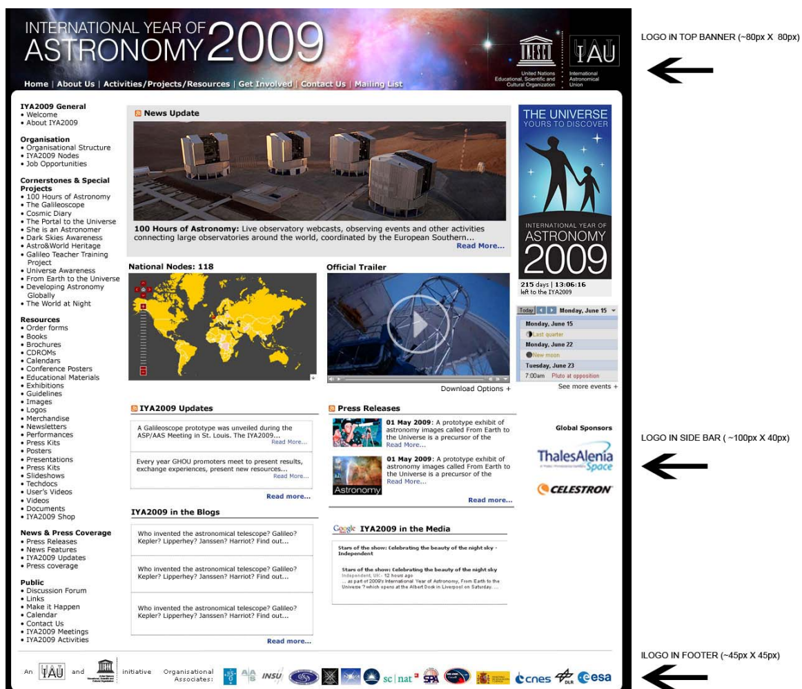
Fig 1. Mock-up of new Official IYA2009 website front page

A new version of the website is under construction and will be released in July 2008. Above is an early mock-up of the new design and layout of the website. The design will be targeted towards the general public and not towards IYA2009 collaborators and scientists as the current site.