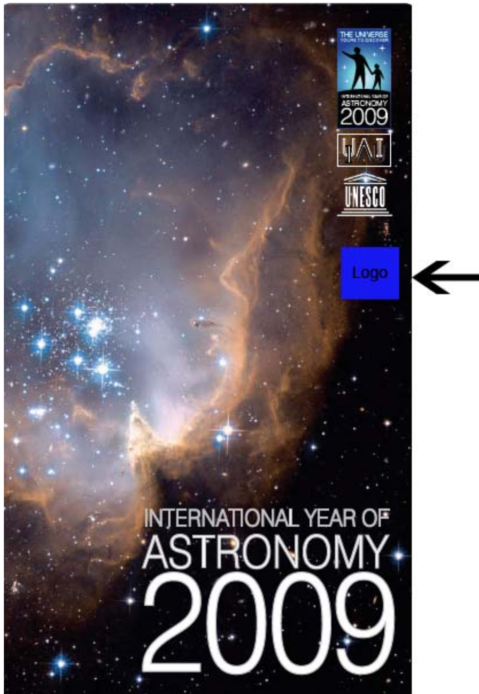
Fig. 5: Cover of brochure version 3.