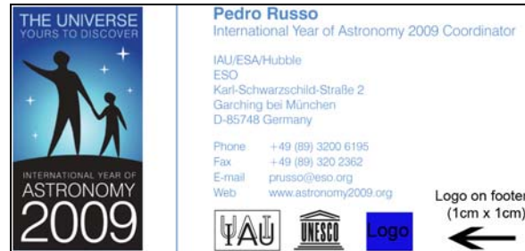
Fig 4. IYA2009 Business card