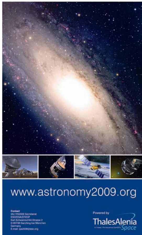
Fig. 6. Brochure version 3 back page.