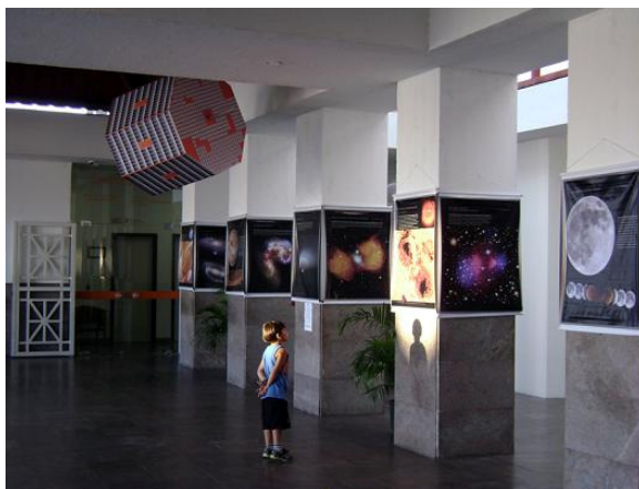
Exhibit "Cosmic Landscapes": 250 sets of 20 panels, displayed on 687 places, attended by 598 127 visitors

Telescopic observations: 307 912 people in 2 609 events