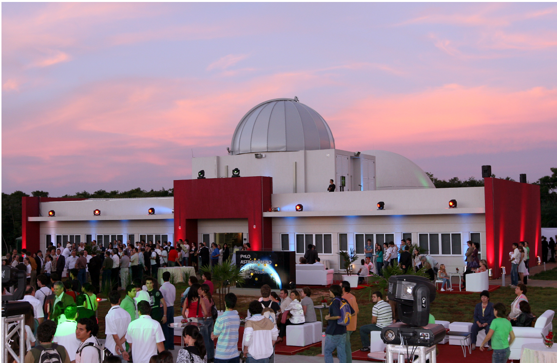
Hundreds of planetarium shows

Hundreds of talks (40 titles), courses, dance performances, theatre plays, music shows