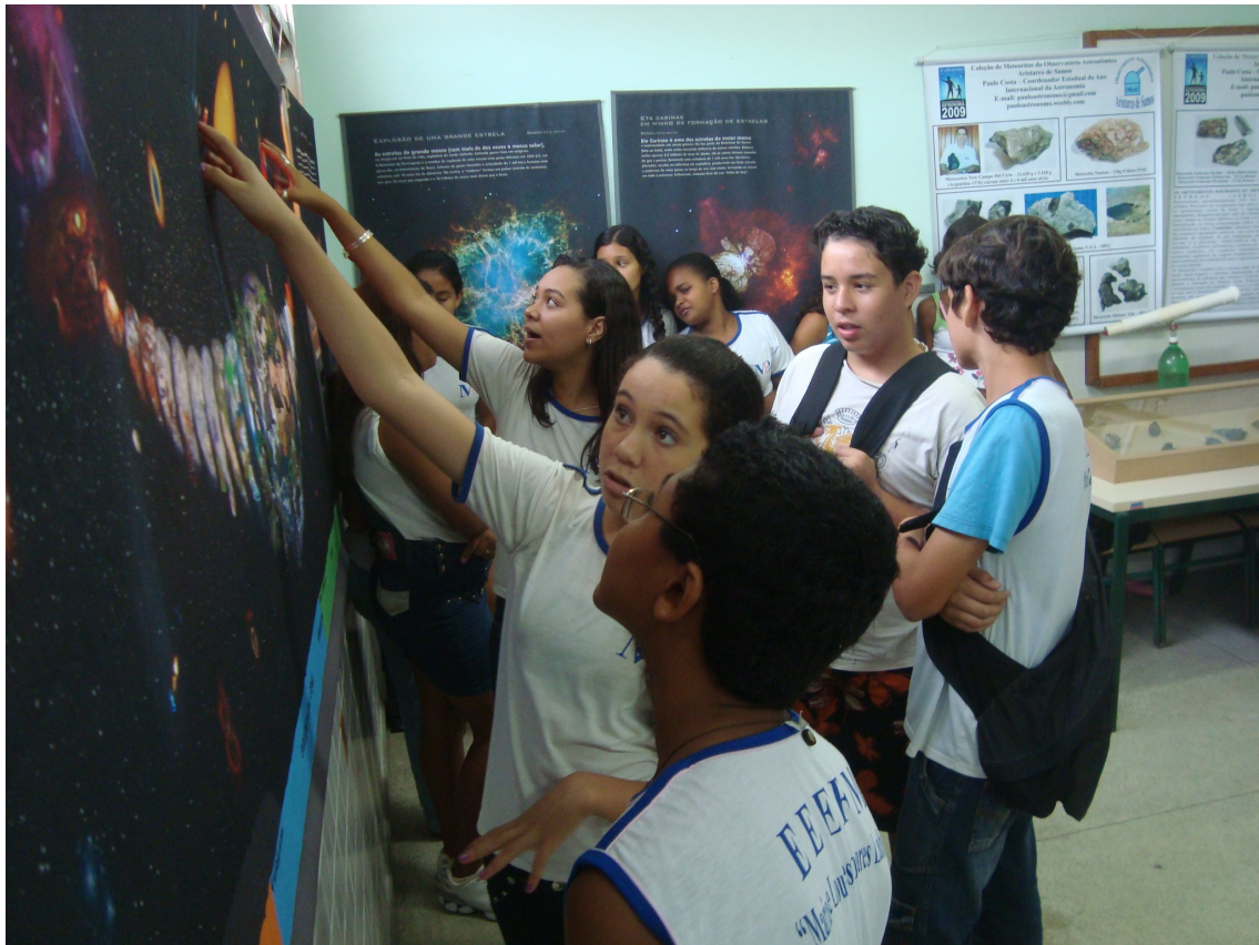
Panel "The Evolving Universe" 1x5m large: featured together with the "Cosmic Landscapes" exhibition, accompanied by 140 000 leaflets