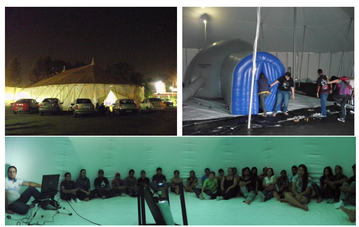
Figure 2 - Sessions in the Portable Planetarium