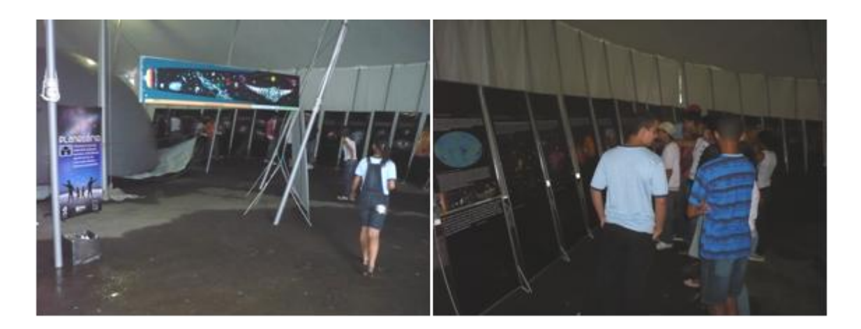
Figure 5 - Exposition "Cosmic Landscapes, From Earth to the Universe".