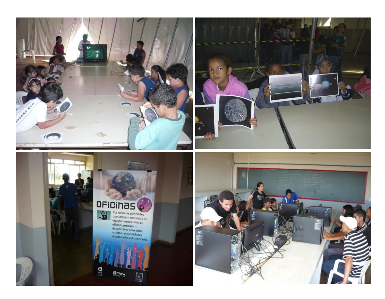
Figure 4 - Workshops