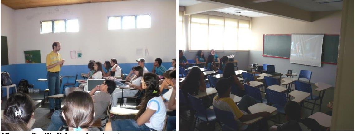
Figure 3 - Talking about astronomy