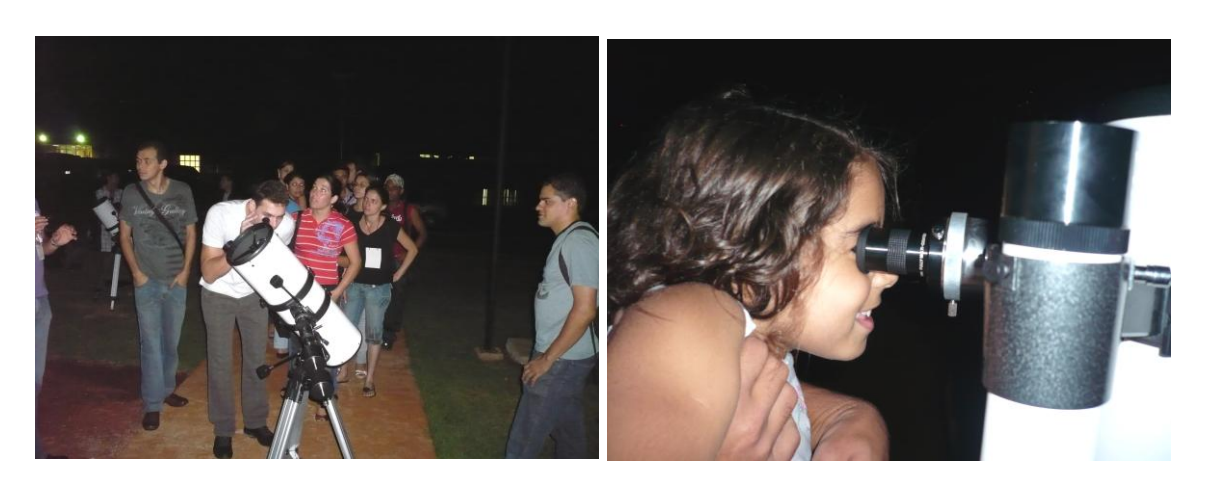
Figure 6 - Astronomical observation